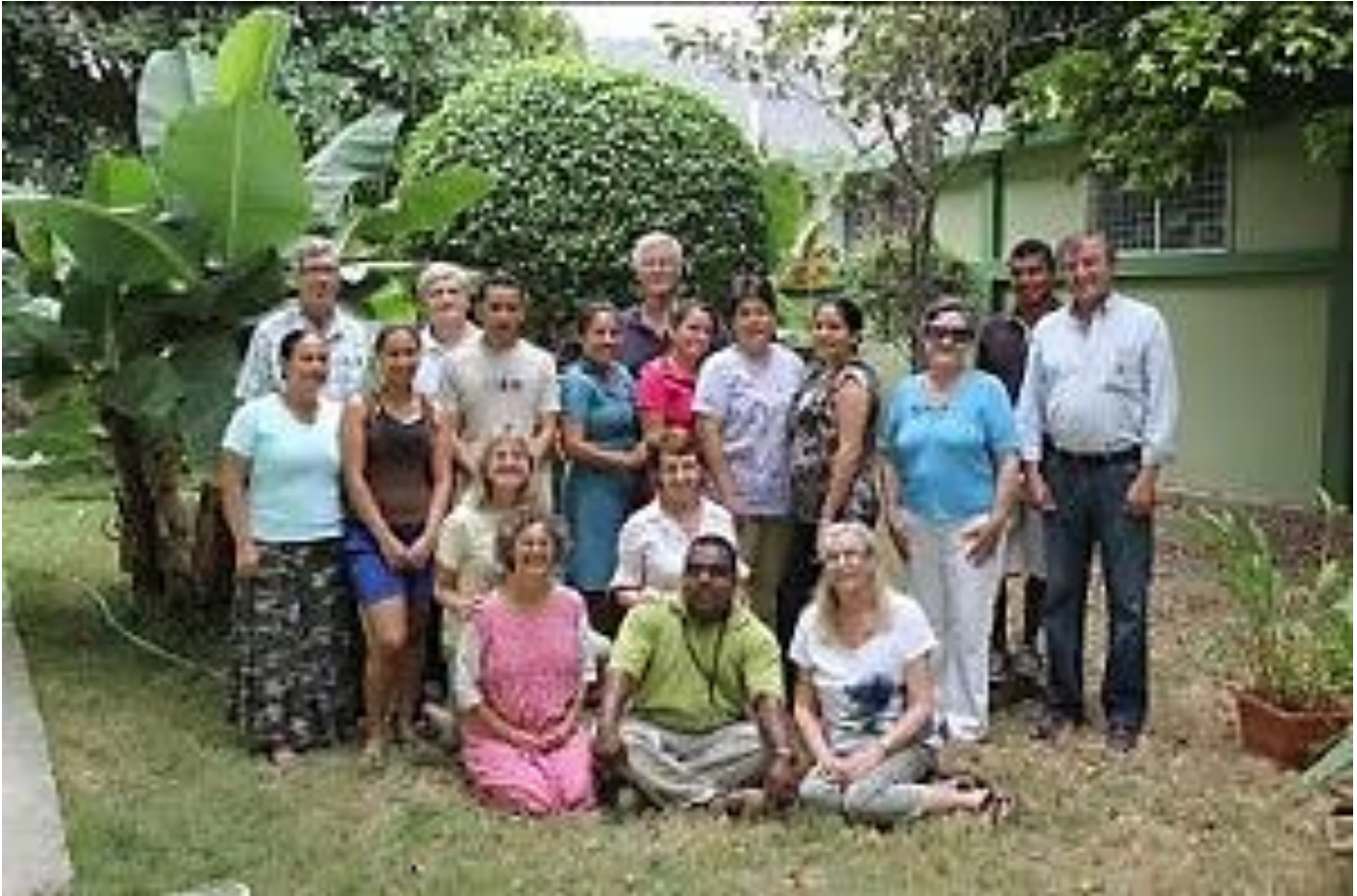
2012 Medical team