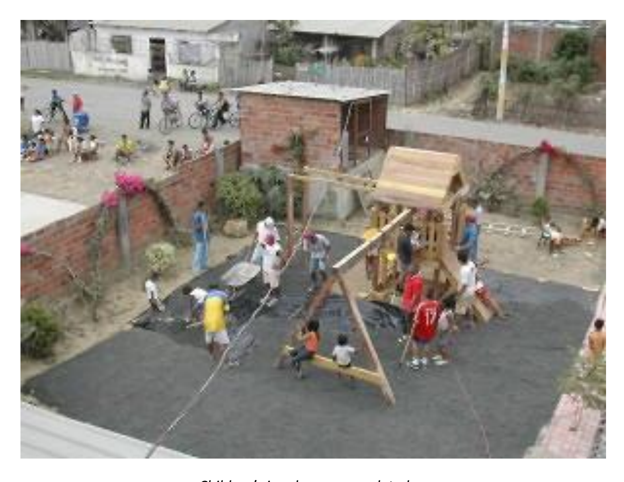
Children's jungle gym completed