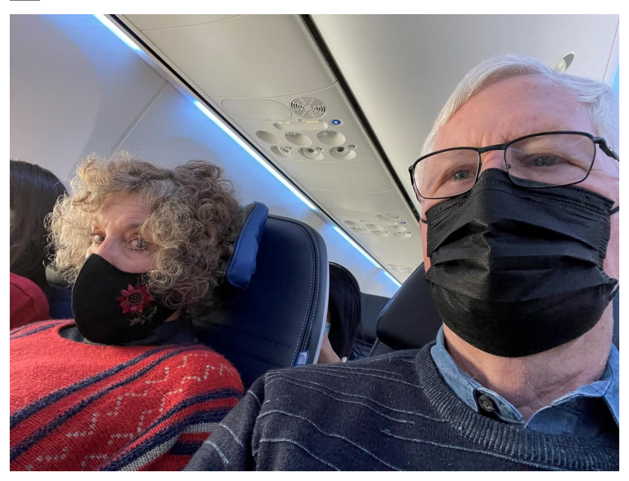
Oh, what fun it is to ride – in an airplane full of masked people!

Yes, masks were required on all airlines and in the terminals. A Covid test was required for entry into Ecuador and when we returned home the US also required one.